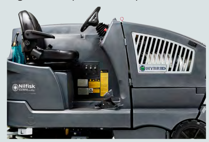
The CS7010 has a fully adjustable seat and tilt steering