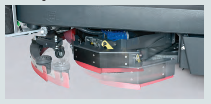
Retractable 10 cm offset disc deck enhances edge scrubbing and resists damage from accidental impact