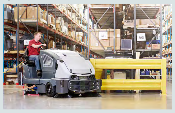
Automatic speed reduction in turns for improved safety and reduced risk of impact damage