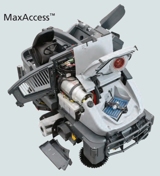
We designed the CS7010 to provide quick access to all vital systems for easier inspection and maintenance