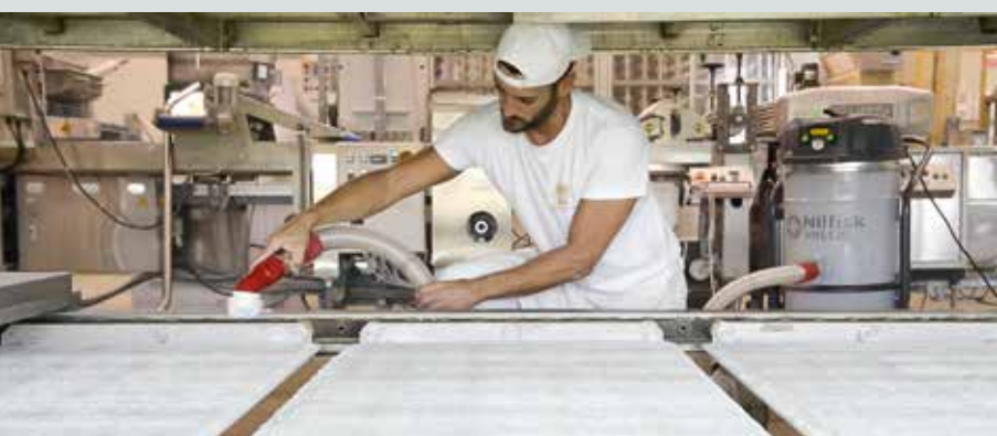
Its compact size allows to reach every corner of the production area with ease