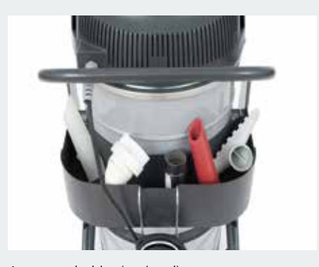
Accessory holder (optional)